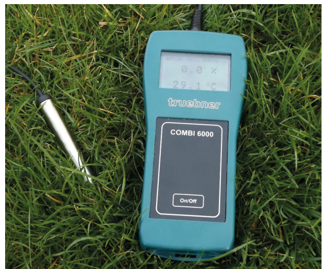
T100 with handheld reader COMBI 6000