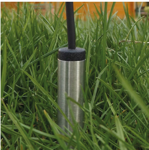
T100 for soil temperature meas.