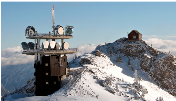
The SWS-250 is ideally suited to provide accurate measurement of raw data for forecasting models.

Whilst the models used for forecasting continue to improve there remains a need for accurate measurement of current weather conditions to provide the model's input. Improvements to forecast accuracy can also be gained by increasing the number of monitoring sites but there is always a trade-off between forecast quality and cost. The SWS-250 is ideally suited to this type of application due to the accuracy of measurement, the wide range of present weather conditions reported and the cost effective design.