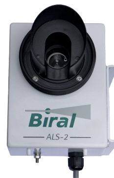
Biral's ALS-2 Ambient Light Sensor

The SWS sensor family is designed for easy installation by a single person and has an interface which simplifies system integration. The ASCII text data message is transmitted at user defined time periods or in response to a polled request. The standard data message provides MOR and EXCO along with present weather codes according to both WMO Table 4680 and METAR standards. An optional interface to the ALS-2 Ambient Light Sensor simplifies use in aviation applications where both METAR and RVR information is required. The ALS-2 Ambient Light Sensor data is appended to the standard sensor data message simplifying both installation and data processing.