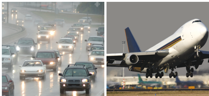
Suitable for a range of applications.

In aviation there is a trend towards increasing both safety and capacity at aerodromes which can require the installation of visibility and present sensors on runways and increasingly along taxi ways. The SWS-250 meets or exceeds all international aviation specifications for visibility measurement and present weather reporting whilst offering an affordable solution for both acquisition and cost of ownership.